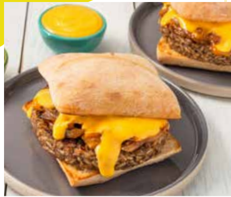
Vegan Mushroom Burger