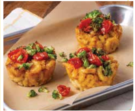
Roasted Vegetable Mac & Cheese Cups

GEN Z MORE LIKELY TO EAT plant-based foods than other members of their family