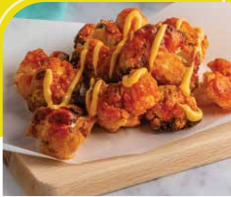
Sriracha-Bufferalo Cauliflower Bites